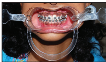
664 Cheek Retractor